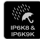
IP & IK protection classes

Matched to individual requirements and needs for versatile applications