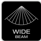
Wide Beam Pattern

For a large-area and wide light distribution