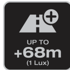
Up to 68 m long beam

For a large-area and wide light distribution