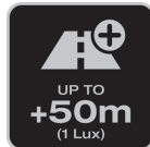
Up to 50 m long beam

For a large-area and wide light distribution