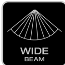
Wide Beam Pattern

For a large-area and wide light distribution