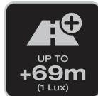
Up to 69 m long beam

For a large-area and wide light distribution