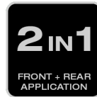
2 in 1: Front and rear application

Matched to individual requirements and needs for versatile applications