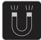
Magnet base & rotatable hook

Delivers up to 270 lumens of bright light for clear visibility in dark spaces