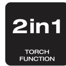
2 in 1 Torch function

Inspection light and Torchlight function